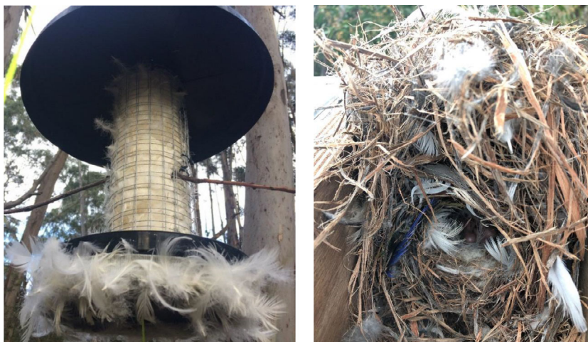
Figure 1 'Feather dispenser' set up in the field (left). Feathers were glued to the base of the dispenser to increase the visual stimulus and encourage utilization of feather dispensers. A small perch was provided on the dispenser to attract pardalotes. Nest (right) where pardalotes used the feathers.

To control for an effect of site and/or season, we divided the study area in two halves; the half that received control 'feather dispensers' in the first breeding season (2017) for the first clutch, received treatment for the first clutch in the second one (2018). Our experimental design also involved switching nests between treatment groups between each successive nesting attempt (pardalotes are multi-brooded) within a season. After a nest succeeded or failed we cleaned the nest boxes to encourage birds to rebuild and swapped their feather dispenser from control to treatment or vice versa. Our sites were laid out so that boxes were close to one another (~20 m between boxes), and all nests in an aggregation were switched between treatment groups simultaneously. Nest initiation and success/failure dates were all highly synchronous, so it was possible to switch groups of nests between experimental treatments with no risk of overlap.